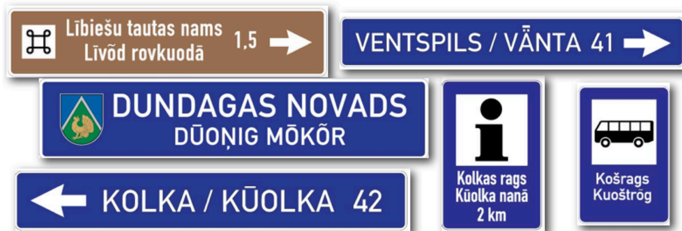
Picture: Visualisation of the bilingual place name signs by Signum and Dundaga municipality Tourist office.